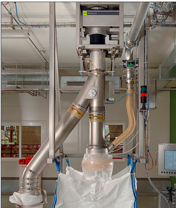
Installation example: IFS compliant metal detection directly before the filling of spice products into bigbags. (old version)